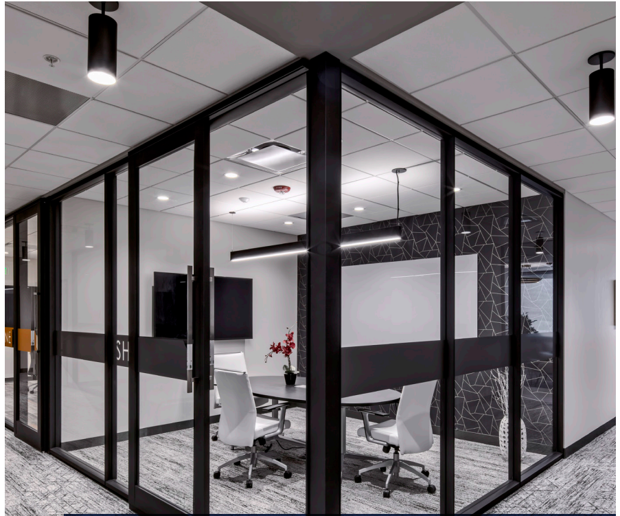
Tenants of Great Oaks Office Park enjoy numerous services including appreciation events like our Ice Cream Social and discounted rates for first-class meeting rooms with conference technology at Hone Coworks, located on the first floor of Building 300.