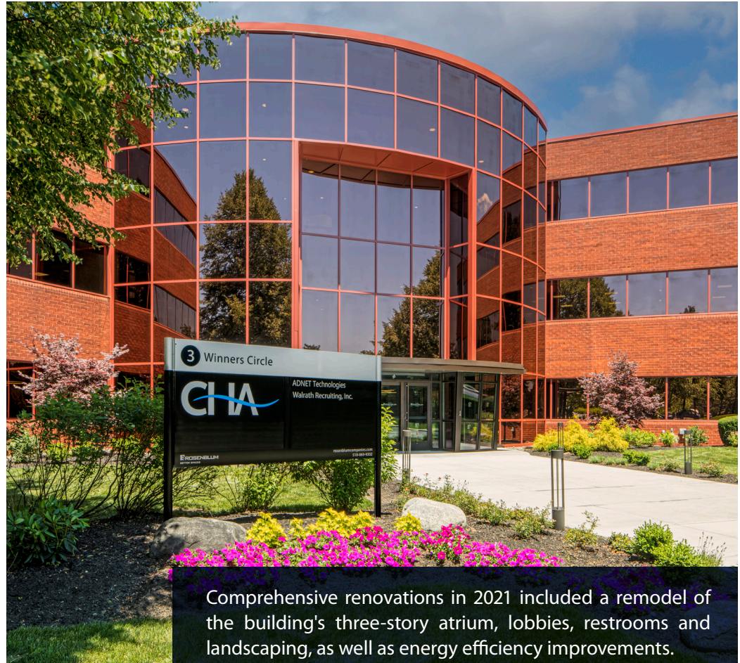
Comprehensive renovations in 2021 included a remodel of the building's three-story atrium, lobbies, restrooms and landscaping, as well as energy efficiency improvements.